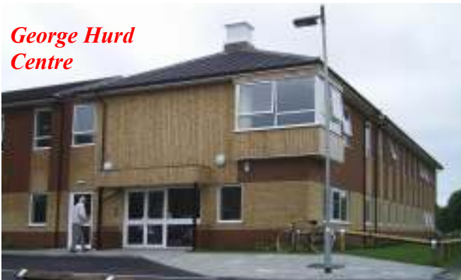
George Hurd Centre

If you are still not sure whether the Basildon Philatelic Society is for you, then you are cordially invited to attend a meeting as our guest.