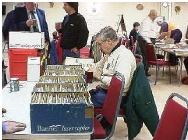
Looking for bargains at a Bourse.

There is a charge of £1.00 per meeting which includes free refreshments.