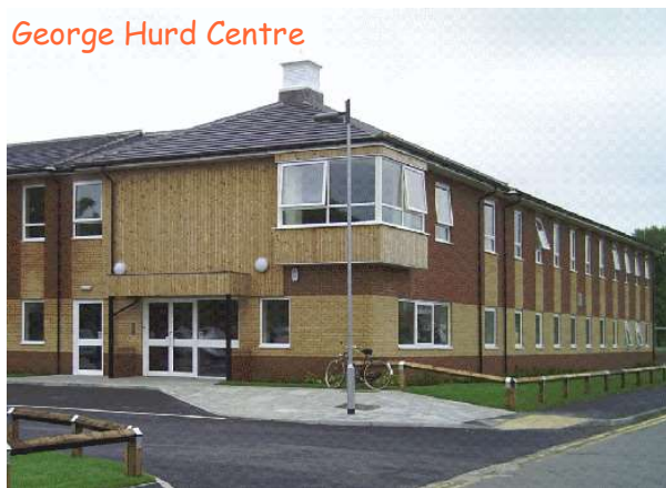
George Hurd Centre

If you are still not sure whether the Basildon Philatelic Society is for you, then you are cordially invited to attend a meeting as our guest.